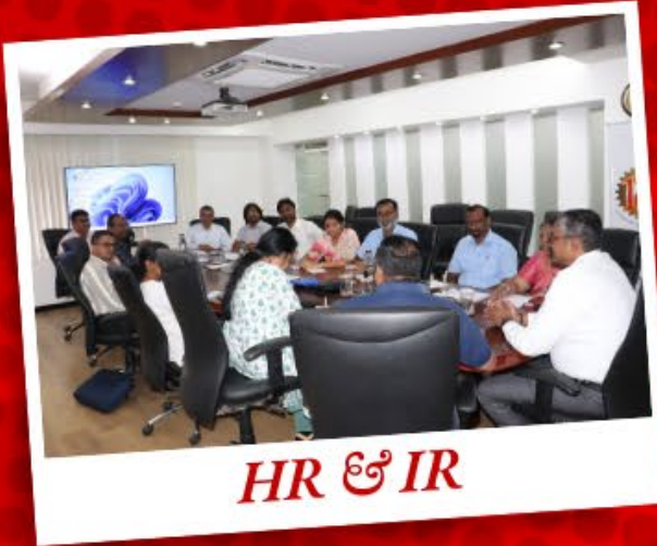
HR & IR