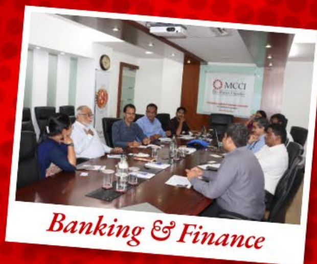
Banking & Finance