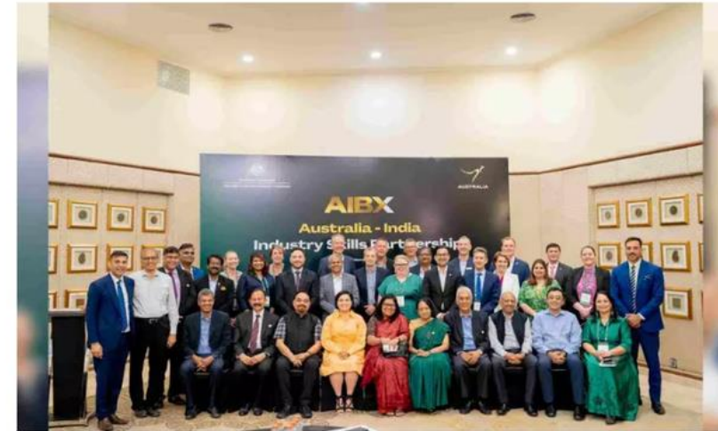
Still from MCCI-Austrade event